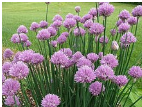
Chives and/or garlic