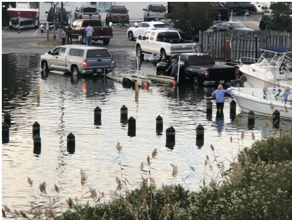
Flooding at the Public ramp located in Location "A"